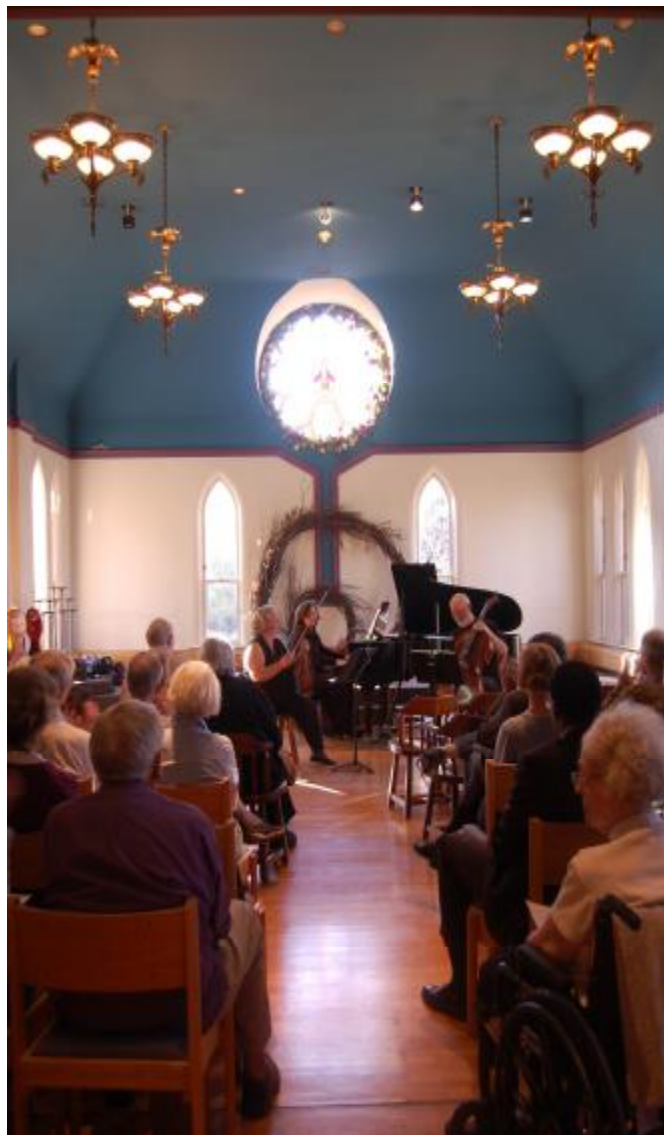
The Three/Four Trio performed a very successful concert in Lukens Wing at St. Barnabas November 11, 2007.

LifeSpark is hosting a "Touching Tomorrow" fundraising breakfast on December 12 th in Lakewood. All St Barnabas members and staff are invited to attend and to learn more about this caring and innovative organization. To learn more about LifeSpark, please visit www.LifeSparkNow.org or call 303-425-5670.