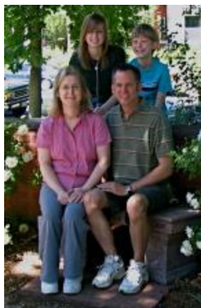
The Mueller family at 2008 garden clean-up.