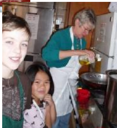
We washed our hands first before starting to mix the vegetables.