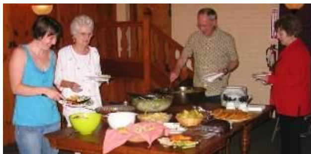
A potluck meal follows the service on the last Sunday of each month.

What distinguishes the contemporary service is its intimacy, sharing and a renewed awareness of God in our lives. It is a peaceful way to end the week and obtain spiritual strength.